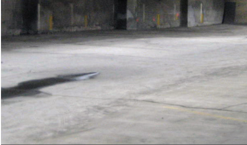
Before and after installation of Stondeck XD2 for superior protection.