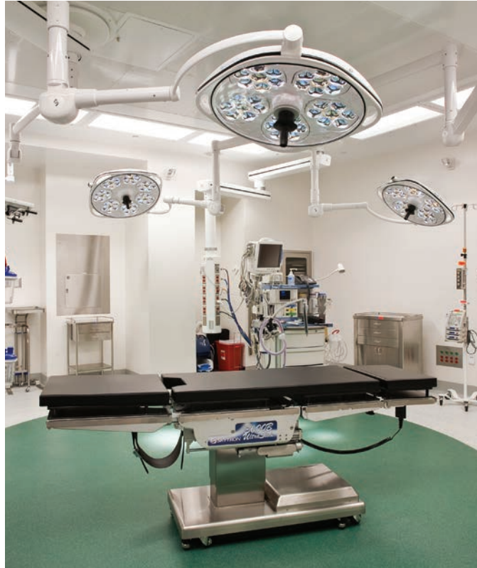
HOSPITAL OPERATING ROOMS, PATIENT ROOMS, CORRIDORS Stonres®