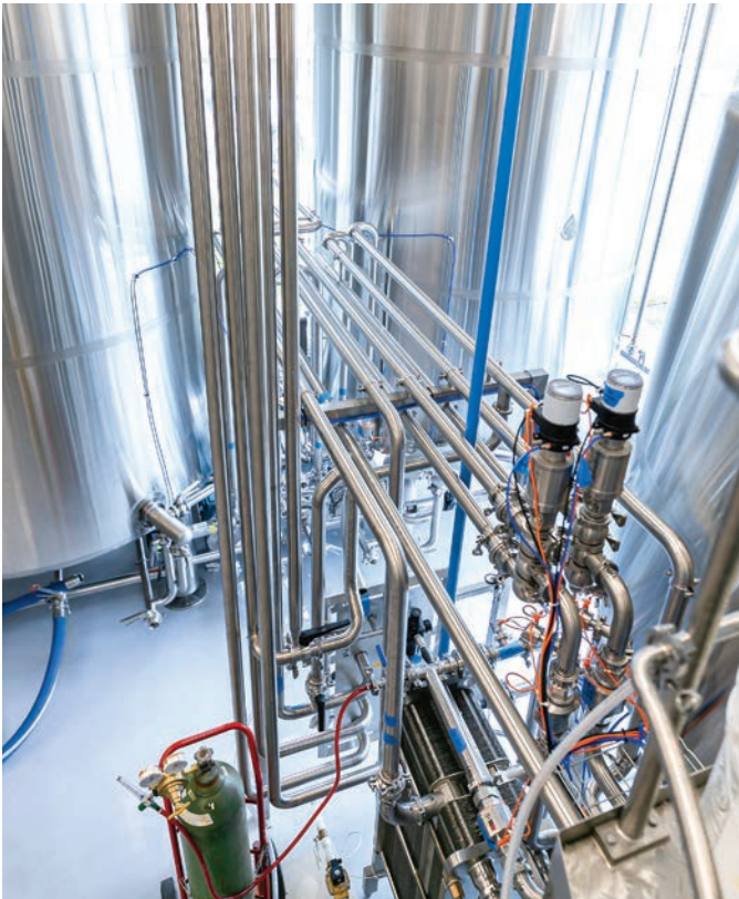
FROM SPOTLESS HOSPITAL CORRIDORS AND BREWERIES TO SLEEK BISTROS, OUR SEAMLESS FLOORS ARE SANITARY, EASY TO CLEAN AND STAND UP TO CONTINUOUS USE.